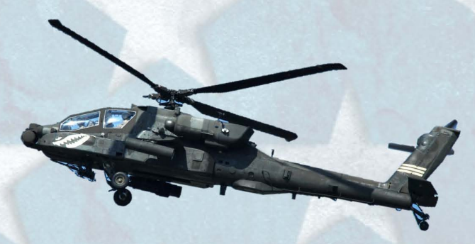
Home of the 101<sup>st</sup> Airborne Division "Screaming Eagles"

Sign up by calling Warren County Extension Office at (270) 842-1681 (Include Name, Age, County, Email, Phone Number) Deadline to Sign Up: March 1, 2024